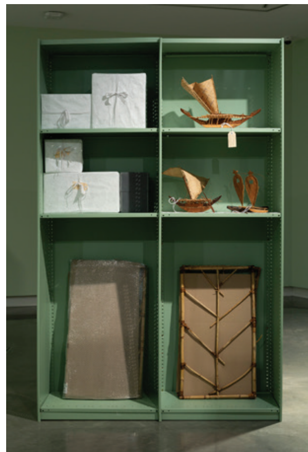
All, Installation view TALOI HAVINI Useful Arts , 2021 11 composite digital images