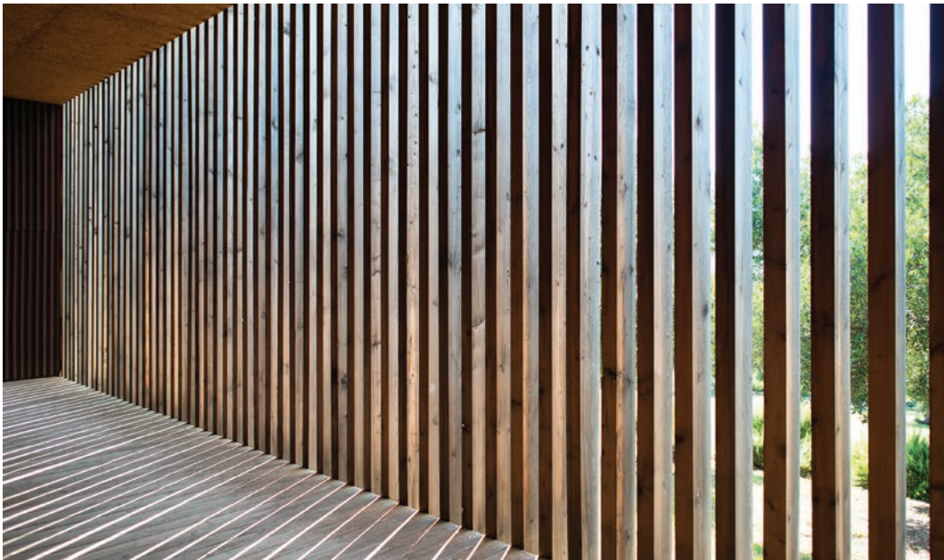
Olafur Eliasson and David Adjaye. Your black horizon Art Pavilion, 2005 Commissioned by Thyssen-Bornemisza Art Contemporary Vienna, Austria Island of Lopud/Croatia, Photo: Zoran Marinovic / TBA21, 2014

Inaugurated in June 2005 at the 51st Venice Biennale to great international acclaim, Olafur Eliasson's light-receptive installation Your black horizon migrated to its now permanent home on the Island of Lopud in 2007. Created in collaboration with the architect David Adjaye, Eliasson conceived an environment in which art and architecture were from the outset considered as one, "an interlocking equation." In a windowless pavilion, a thin horizontal line of light directed through a narrow gap at eye level runs around the black space, serving as the primary light source. Eliasson notes: "Both pavilion and horizon work with sequentiality and light. The visitor moves from the entrance of the pavilion, to seeing natural daylight filtered through its louvers, to the passageway leading into the interior which brings one into the black space of Your black horizon ." Adjaye adds: "This project offers a unique opportunity in which the artist and architect share the same studio (albeit metaphorically) to engage, to respond to one another, and to respond to the site specified for the pavilion."