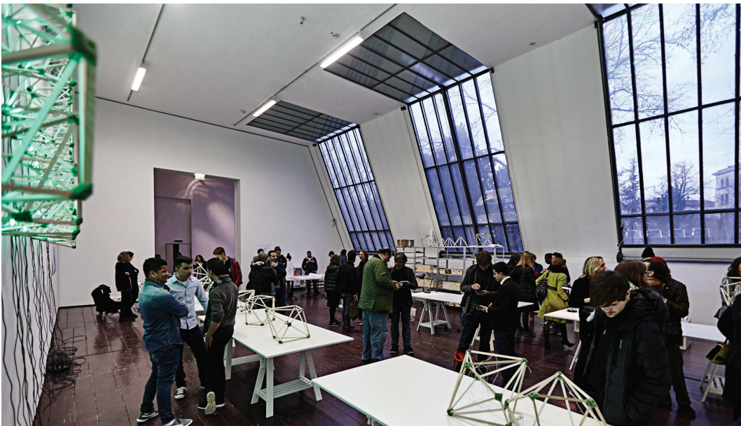
Olafur Eliasson – Green light | An artistic workshop Green light – Shared Learning, TBA21–Augarten.

The crystalline Green light lamps are polyhedral units fitted with small, green-tinted light fixtures. Made predominantly from recycled and sustainable materials and designed to be stackable, the modules can function either as single objects or be assembled into a variety of architectural configurations. At TBA21–Augarten, the lamps will form a steadily expanding environment in the exhibition space that carries the narratives of its making.