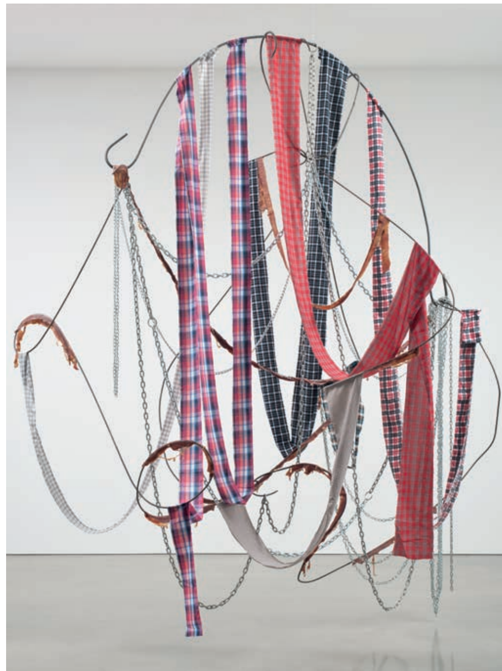
ABRAHAM CRUZVILLEGAS, BOOGIE WOOGIE (HANDMADE & SENSUAL) , 2012